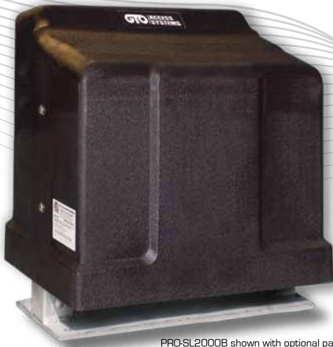
PRO-SL2000B shown with optional pad mounting plate (SGMP).

Technology • Innovation • Quality Since 1987